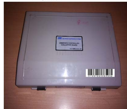
Fig 2. This shows the electronic product which must be tested through seven stations. It has Barcode for the identification.