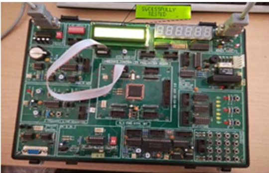
Fig 5. A message 'Successfully tested' on LCD clears the functionality test.