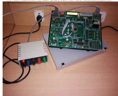
Fig 3. This shows the electronic product in PCB form. This is PCB which has chip to be tested that has 'Barcode' for its identification. The chip in PCB has been encircled.