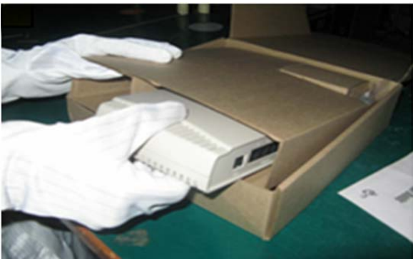
Fig 7. : Packing of PCB in a Case.