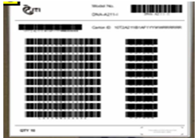
Fig 9. Barcodes of ten PCB's in Carton.