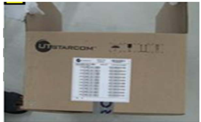
Fig 10. Packed PCB's placed in a Carton.