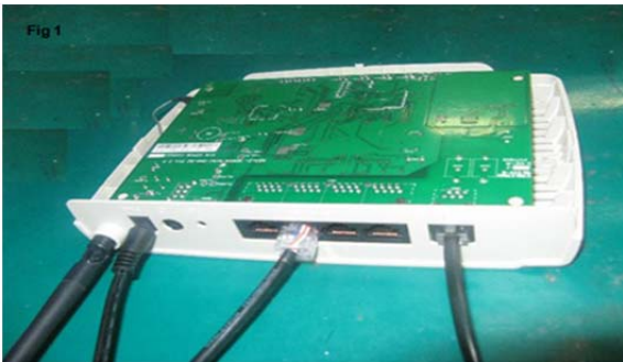
Fig 6. The PCB is cased and Barcode is placed followed n Functionality Test.