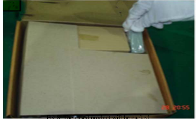
Fig 8. The cased product will be packed.