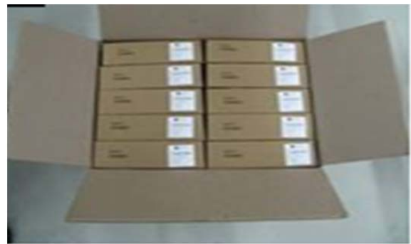
Fig 11. Ten packed products are placed in Carton and new Barcode is generated and placed on it.